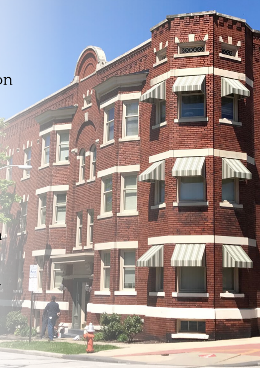
The Harp Apartments (corner of West 64th Street and Detroit Avenue) received $2M in renovations in 2016.

Notable achievements of the Real Estate Development team include several sustainable building projects in the Cleveland EcoVillage (2003-present), the redevelopment of the Gordon Square Apartments (2006), the reopening of the Capitol Theatre (2009) and the completion of the Templin Bradley Co. Lofts (2015).