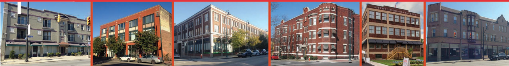
A Detroit Chateau 7918 Detroit Ave B Near West Lofts 6710 Detroit Ave C Gordon Square Apt 6518 Detroit Ave D Harp Apartments 1389 W 64th E Templin-Bradley 5700 Detroit F Courtland Bldg 1406 W 54th

DSCDO has developed 17 buildings (and owns 16 of them*) with over 300 rental units for low to moderate income families, and approximately 50,000 square feet of commercial space. *DSCDO does not own (H) Cogswell Hall