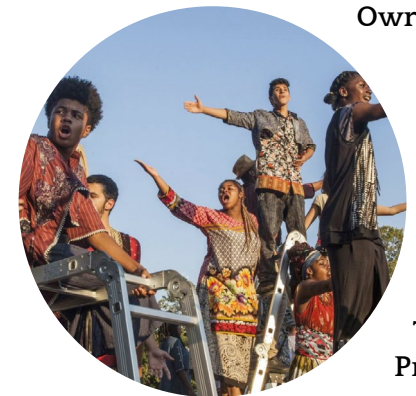
Cleveland Public Theatre’s Student Theatre Enrichment Program

The Near West Side is already home to outstanding youth programming at neighborhood theaters, parks, recreation centers, and libraries. Partnering with MyCom will help connect youth to these programs, and identify gaps where future programming could be beneficial. Stay tuned for a guide coming this summer compiling all Detroit Shoreway, Cudell, and Edgewater neighborhood youth programming opportunities. A steering committee of youth-serving organizations, schools, and residents will assist with the information gathering process.