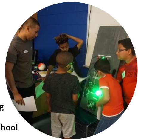
Manufacturing Camp at Max Hayes High School