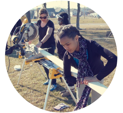
Kent State Cleveland Urban Design Collaborative and Seventh Hill’s Making Our Own Space workshop

MyCom is a network connecting Greater Cleveland youth to programming in their neighborhoods, preparing them for their futures while giving back to their communities. The 10-year-old network includes 21 communities. Detroit Shoreway Community Development Organization (DSCDO) and Cudell Improvement Inc. (Cudell) are excited to partner with MyCom in 2019 to ensure the network will cover the Detroit Shoreway, Cudell, and Edgewater neighborhoods.